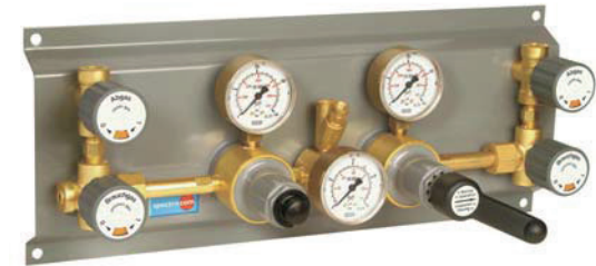
CRS2000V-2L automatic change-over model