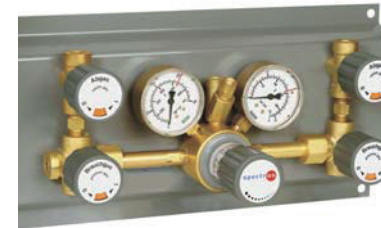
CRS2000V-2 manual change-over model