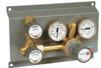
CRS2000V-1 single-sided model