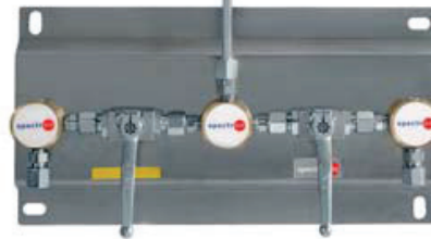
Pressure control panel BT2000AC-2x1-M-KH-SV-0 for acetylene with SV73